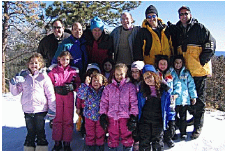
FLOWER WOLVES TRIBE