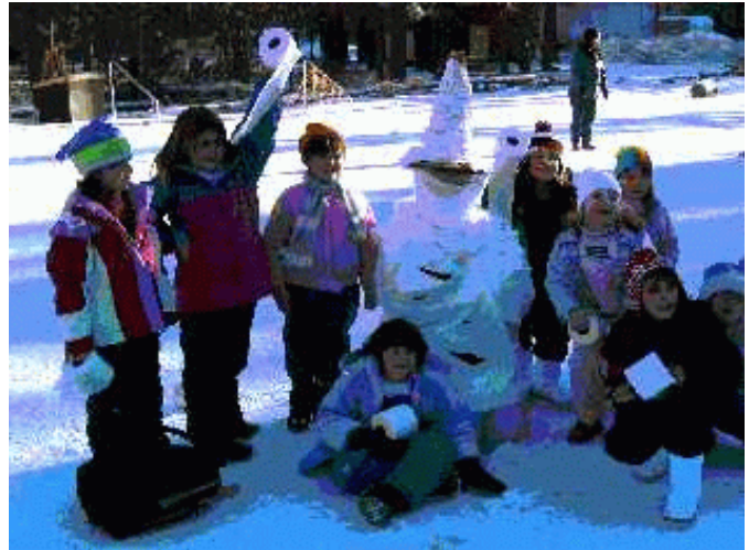
RISING STARS TRIBE